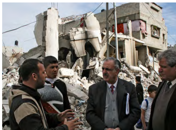
Rubble of Shijaiya Clinic

The clinic building was established in 1968 to meet the needs of the Shijaiya community in Gaza, which is known for its high population density and where the majority of the residents are living under the poverty line. The clinic offered treatment free-of-charge, concentrating on pregnant women and children.