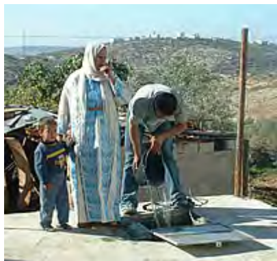
MECC/DSPR water cistern