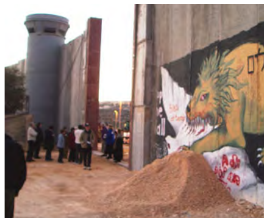
Bethlehem Wall Crossing

The Wall: This barrier, which is larger than the former Berlin wall, not only separates Israel from Palestine, but also separates Palestinian communities from each other. Special regulations require Palestinians to obtain permits even to approach the wall in some areas, while Jewish people are able to enter these same areas unrestricted. In 2004, the international Court of Justice ruled that the wall is illegal and must be dismantled, and ordered Israel to compensate Palestinians damaged by the wall's construction. The 2005 General Assembly of the Christian Church (Disciples of Christ) passed a resolution entitled "Breaking Down the Dividing Wall" that called for the wall to be torn down. Today the wall continues to be expanded.