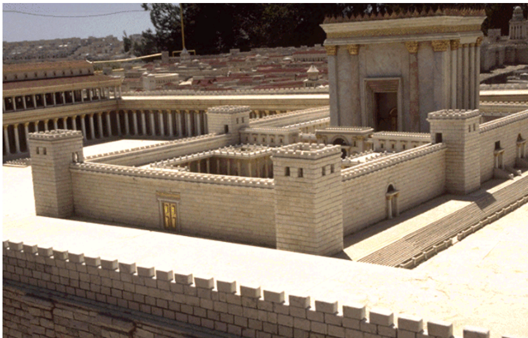
Illustration of the Temple in Jesus' day.

Prayer: The following prayer was written by the heads of the churches in Jerusalem. They invite churches around the world to pray with them.