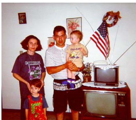
First Christian Church in Lincoln, Nebraska, resettled this Bosnian family who celebrated the new life they have received in the United States thanks to the church.

Before arriving with only the clothes on their backs, two duffle bags and one stuffed animal, they had spent six months in a large refugee camp in Zagreb, Croatia having fled from their home in Banja Luka, Bosnia. Forever in my memory, I shall hear the ring of some of the first words this father uttered with the help of an interpreter: "Will I make enough money so my child will not starve?"