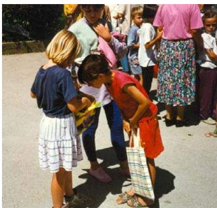
Students receive their school kits

In Banovici (near Tuzla) the delegation experienced the joy of a CWS school kit distribution. Forty-eight cartons of school kits had been sent by CWS and they were distributed to 270 children who were students that came from the collection centers in the vicinity. The excitement on the children’s faces was overwhelming and they ran around looking inside each other’s school kit to see what they had received.