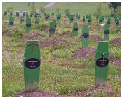
Graves of those killed at Srebrenica (Photo: Week of Compassion Seminararians Trip, 2006)

pregnant women in the area. They expressed so much appreciation for such a small amount of what they would need to care for their babies that it showed the delegation the desperate needs they really had. In Tuzla, the delegation visited “Children Yesterday, Today and Tomorrow” who took them to the Jezevac collection center located on the road to Banovici which contained people who fled Srebrenica and Bratunac – mostly elderly women and men and mothers with children who lost their husbands. They told stories of the extreme disappointment they felt by the lack of protection they had received from the United Nations which was to guarantee the Srebrenica as a “safe area.” They told of seeing their husbands, brothers and sons executed before their eyes in the final collapse of the city. They expressed dismay that they seemed to be forgotten and received little attention. The women expressed that they found the future extremely bleak without their husbands and fathers.