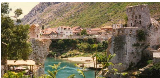
Mostar Bridge in 1996 – two views

In Mostar, the Neretva River divided the eastern and western parts of the city – the Muslim Bosnians from the Catholic Croats. A very famous bridge built by the Ottoman Turks in 1566 spanned the river and was a World Heritage site. It was the symbol of the connection between the two ethnic groups and religions, and was a particularly poignant symbol of the country’s change from one that tried to build bridges of understanding among the various ethnic groups to one that sought the elimination of ethnic groups. (See the story about the refugees resettled by Jeffersonstown Christian Church below for further details about the bridge.)