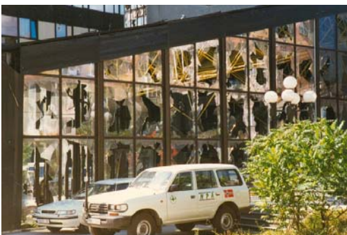
Damaged windows of UNHCR headquarters (UNHCR – United Nations High Commissioner for Refugees)

One's first impressions come from what one sees. In Sarajevo, I saw thousands of windows with broken glass, due to artillery fire. A year after the firing had stopped many of the windows have still not been replaced, and shattered glass can be seen everywhere.