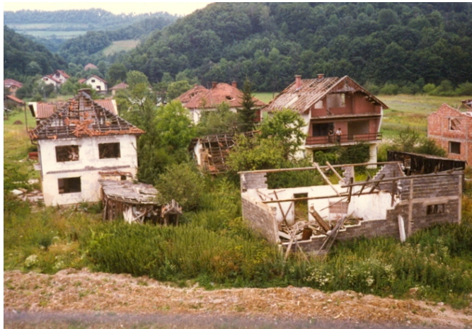
Destruction in Bosnian village

Bosnia and Herzegovina ( hereafter referred to simply as Bosnia ) was the only republic of former Yugoslavia established on a geographical/historical basis rather than on an ethnic one. Bosnian refers to someone who lives in Bosnia, not to a religious or ethnic group. Before the war, Bosnia's population was approximately 44 percent Muslim, 31 percent Serbian, and 17 percent Croatian, along with a smattering of Roma (Gypsies), Albanians, Ukrainians, Poles, and Italians.