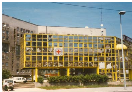
Damaged Red Cross Building