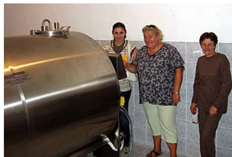
The milk collection cooperative