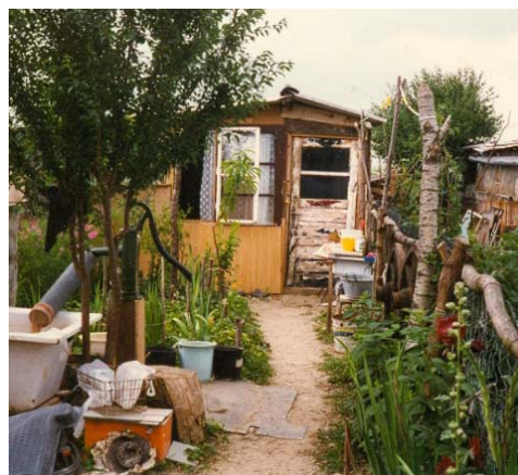
Summer house at Spansko

On the outskirts of Zagreb was the Spansko collection center where displaced Croatians from Vukovar were sheltered. Many women there had managed to escape with their children from the brutality of fighting in Vukovar, and they had horrible stories to share about their escape and the loss of husbands, fathers, and brothers. Many were still awaiting word on missing husbands and relatives. This is where the delegation met the little girl that had not spoken in four years. Yet in the midst of the trauma the displaced Croatians had experienced, the daily life in the collection center showed signs of hope. There were flower and vegetable gardens tended by the residents, and the delegation was hosted in the “summer house” of a couple who had constructed a home in their garden from scrap lumber in order to get out of the dormitory for at least the summer season.