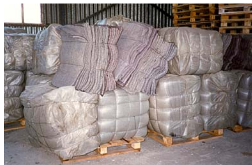
CWS blankets in Croatia

Fifty years from now, some Disciples' member born this year will probably be celebrating his or her 50 th birthday in Europe. My prayer is that that person will discover that CWS is not needed in Europe anymore!