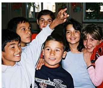
Roma children