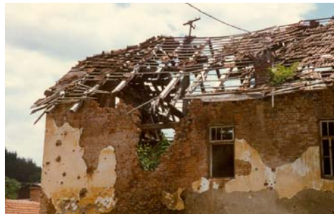
Destroyed Bosnian House

With the signing of the Dayton Agreement and the Peace Accords at the end of 1995, the conflict in Bosnia came to an end, and the way was paved for the return of refugees and displaced persons to their homes. The disintegration of the former Yugoslavia resulted in the death of more than 250,000 people, forced one million to become refugees, and internally displaced one million – all of this within a country of just over 23 million people. It would be less than three years before fighting would again erupt – this time in Serbia's southern Kosovo province between ethnic Albanians and Serbs.