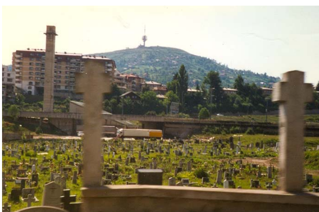
Sarajevo Olympic soccer field – now a cemetery

At the end of the 1980s, Slovenia began its drive for secession, with Croatia not far behind, and on June 25, 1991, Croatia and Slovenia proclaimed independence from Yugoslavia. The government of Serbia responded with a call for a Greater Serbia – the union of all Serbs in Yugoslavia within one contiguous state. Serb forces overran 30 percent of Croatian territory.