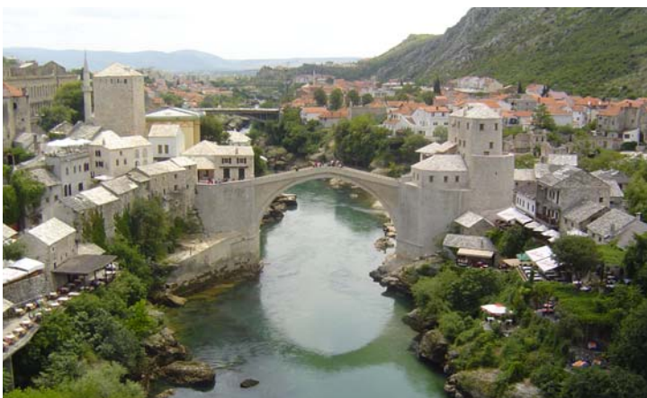
Reconstructed Mostar Bridge today – once again a symbol of the connection between ethnic groups

The delegation visited a collective center for the elderly and mentally ill in Mostar. During the war, the elderly and handicapped were often abandoned as people fled for their lives. They lived on the streets during the worst of the bombing in Mostar. This center, with the help of a former mental health worker, was now caring for the elderly that had been left behind. They were also trying to locate relatives. The delegation also visited the Church of Saints Peter and Paul to thank them for their help with the elderly and handicapped. This church cooperated with Church World Service during the war to distribute high energy food, blankets and underclothes to the elderly. The Sanctuary of the church had been completely destroyed, but the attached monastery was mostly unharmed.