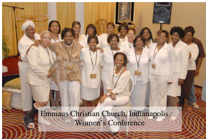
Emmaus Christian Church, Indianapolis Women's Conference

Help us fill this space. . . We want to hear your joys, concerns and how your Women's ministry is transforming lives. God is awesome! Share what He has done for you or your group at odw@dhm.disciples.org .