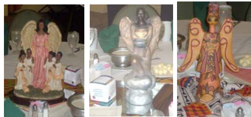
Our tables were filled with both angel centerpieces and angels sitting around the table.