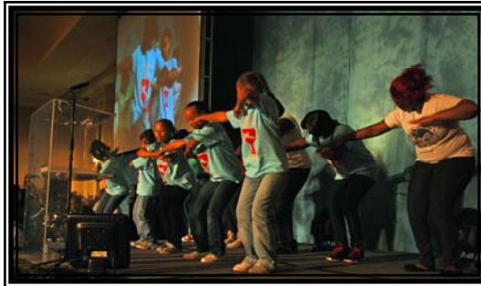
Young Adult Steppers opened our worship