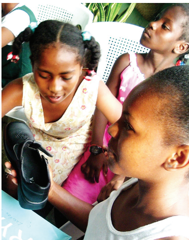
Shoes for the children of Caminante in the Dominican Republic (Women-to-Women).

True community is experienced especially when all are present at the Table of the household of God — with God as head of the household, and God's children seeking to follow the gracious example set by God, welcoming others as God welcomes. As part of this community of God's household all seek to reflect the values provided by God in Jesus Christ, moving past the needs of safety and comfort to