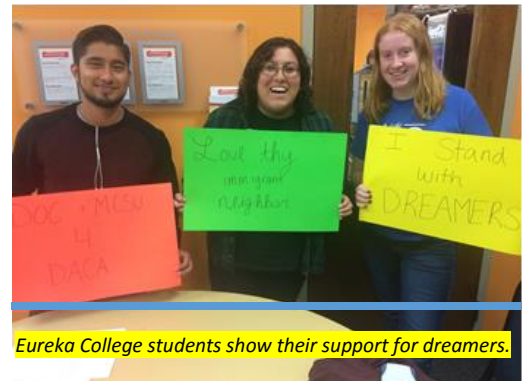
Eureka College students show their support for dreamers.