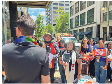
Immigration Court Prayer Vigil in Memphis, TN