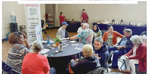
Disciples Advocate at the PSWR Regional Gathering