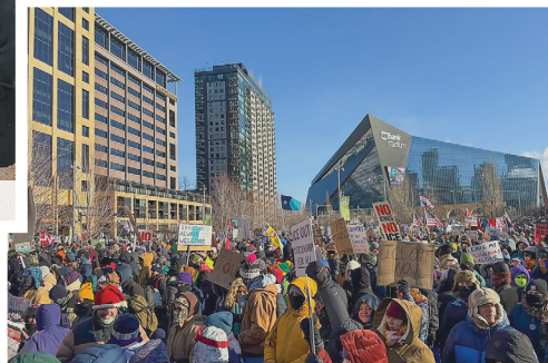
Public march and rally in Minneapolis, MN