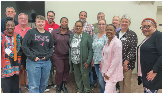
Environmental Justice Clergy Retreat at Christmount