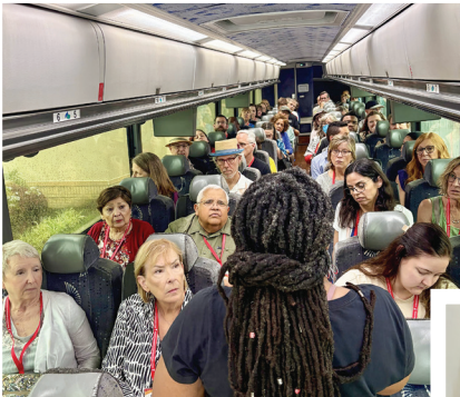
Bus ride to DHM & DOM General Assembly event at the National Civil Rights Museum in Memphis, TN